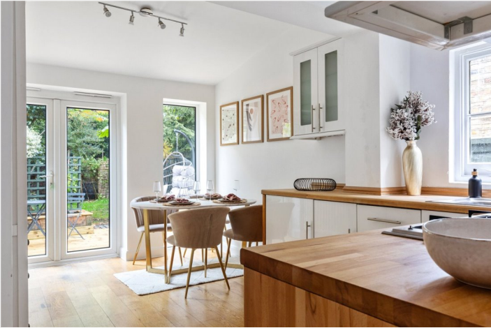
SHAKESPEARE ROAD, SE24 £595,000 SHARE OF FREEHOLD