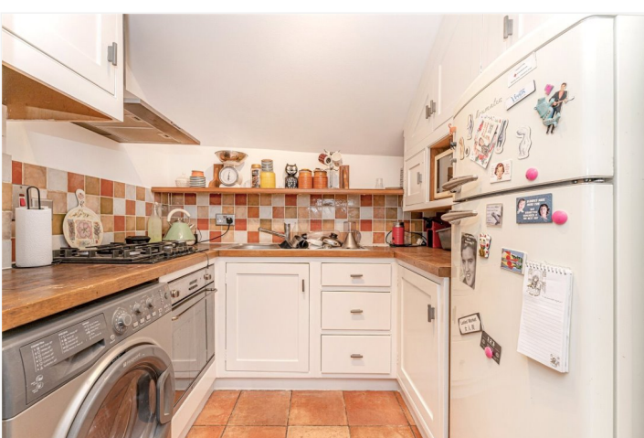
ST. QUINTIN AVENUE, W10 OFFERS OVER £500,000 LEASEHOLD