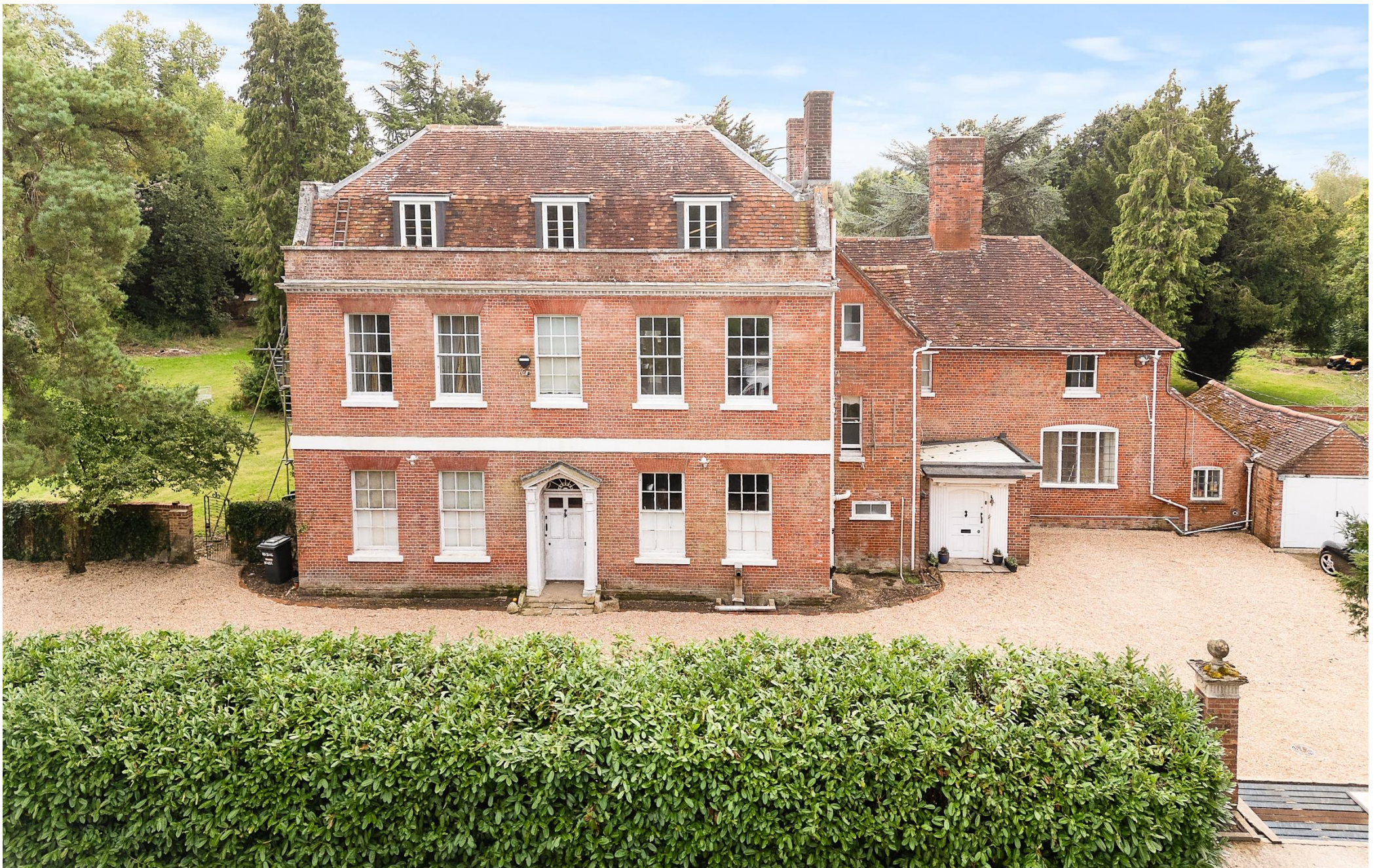
Nursling House, Church Lane, Nursling, SO16 0YB