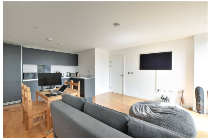
HAWTHORNE CRESCENT, SE10 £2,150 PER MONTH FURNISHED