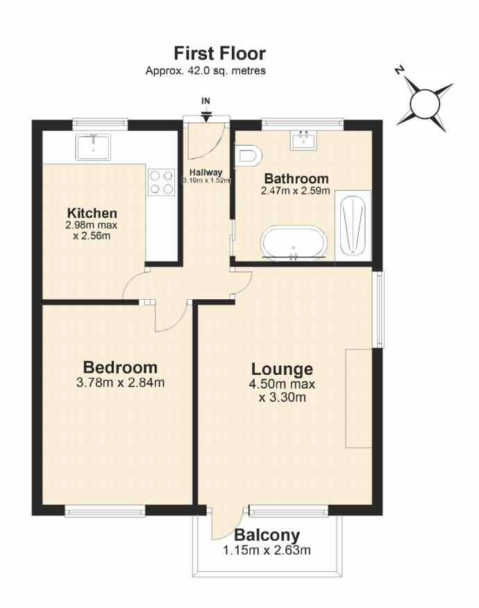
Flat 4 Busby House, Aldrington Road, London

This floorplan is for illustration purposes only and is not to scale. The position and size of doors, windows, appliances and other features are approximate.