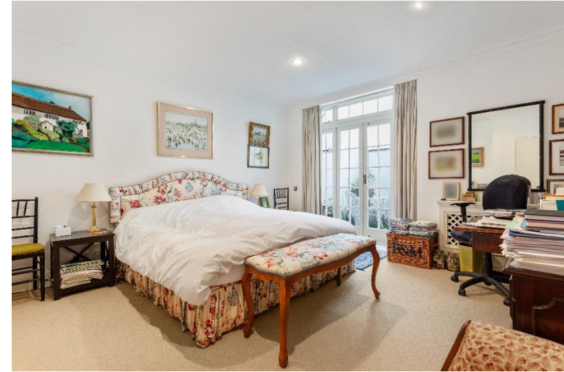
Private entrance | Communal Gardens | Share of Freehold | Patio Garden