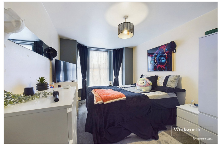
PANGBOURNE STREET, BERKSHIRE, RG30 1HS OFFERS IN EXCESS OF £300,000 FREEHOLD

INVESTMENT OPPORTUNITY. FREEHOLD OF TWO ONE BEDROOM APARTMENTS IN A VICTORIAN TERRACE CONVERSION A MILE AND A HALF FROM READING TOWN CENTRE