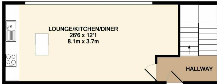
TOP FLOOR APPROX. FLOOR AREA 393 SQ.FT. (36.5 SQ.M.)

TOTAL APPROX. FLOOR AREA 786 SQ.FT. (73.1 SQ.M.)