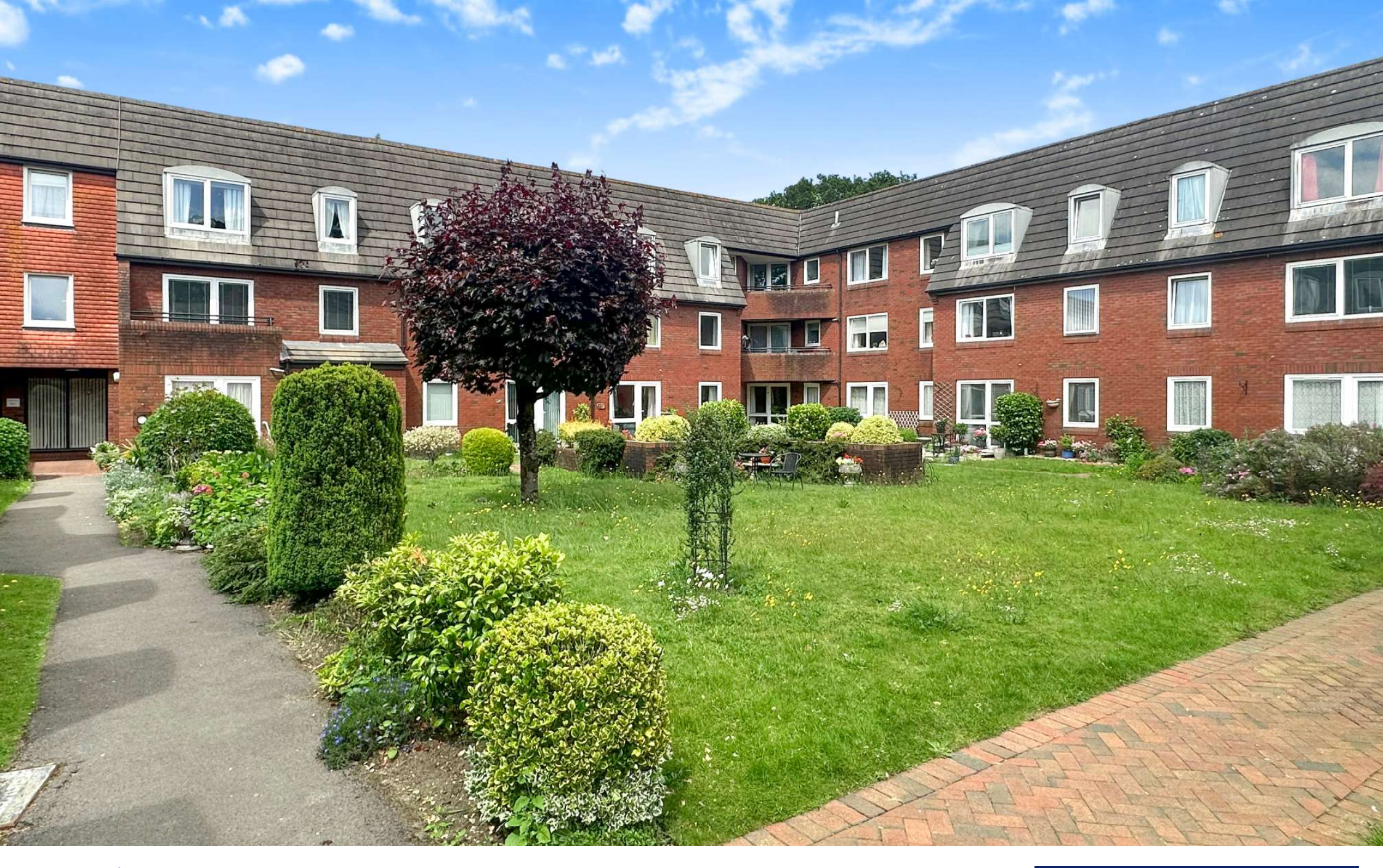
35 Homelands House, 535 Ringwood Road Ferndown, BH22 9DA Guide Price £87,500