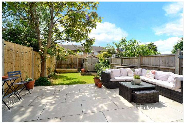
HAMPTON ROAD, WORCESTER PARK, KT4 £465,000 SHARE OF FREEHOLD

A SUPERB TWO DOUBLE BEDROOM GROUND FLOOR MAISONETTE WITHIN WALKING DISTANCE OF THE HIGH STREET AND ZONE 4 TRAIN STATION