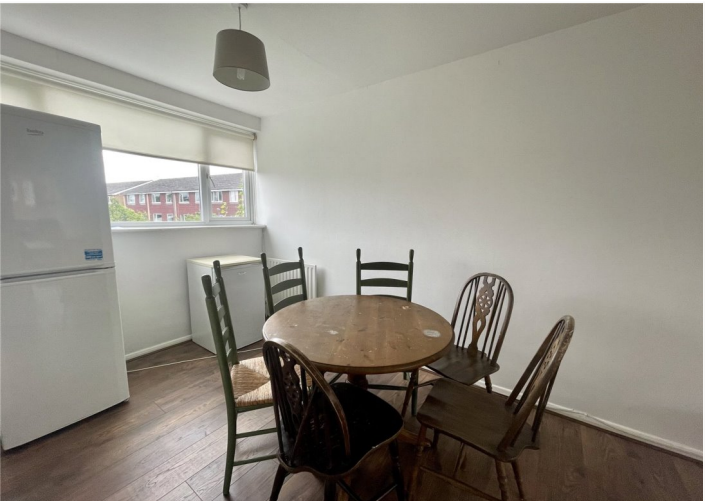
Dollis Drive, GU9