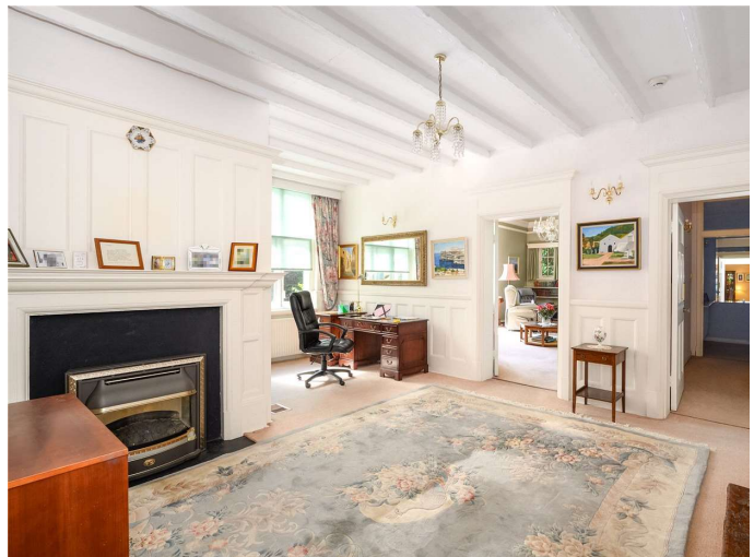
Flat 1, St Michaels, 31 Oatlands Chase, Weybridge, KT13 9RP Asking Price €695,000 , SHARE OF FREEHOLD

A rare opportunity for a very spacious converted ground floor apartment with its own private entrance and direct access to a private garden, garage and off-street parking.