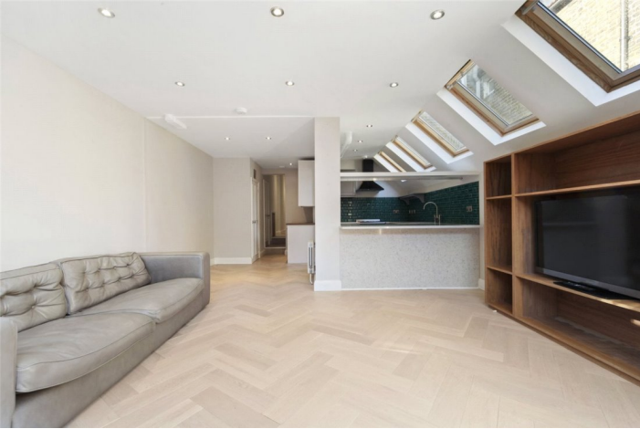
PERCY ROAD, LONDON, W12