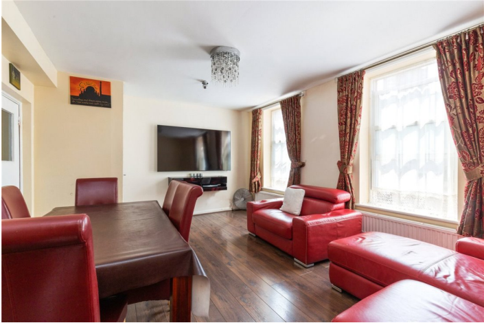
BRUNE HOUSE, BELL LANE, LONDON, E1 £595,000 LEASEHOLD