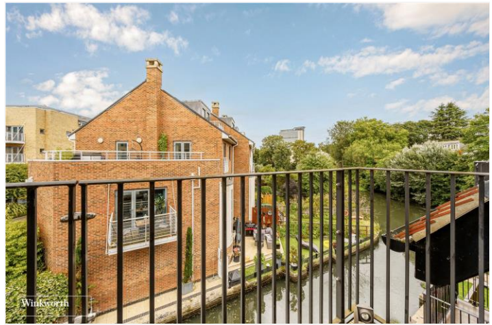
TALLOW ROAD, LONDON, TW8 £1,299,950 LEASEHOLD