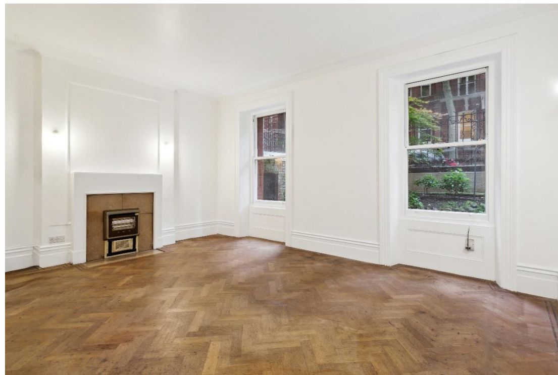
Unmodernised | Twp Double Bedrooms | Long Lease