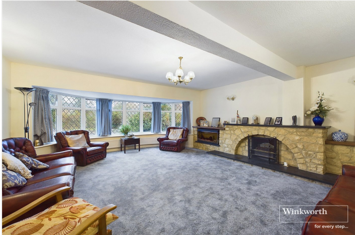
HOLLOW LANE, SHINFIELD, READING, RG2 9BT OFFERS IN EXCESS OF £950,000 FREEHOLD