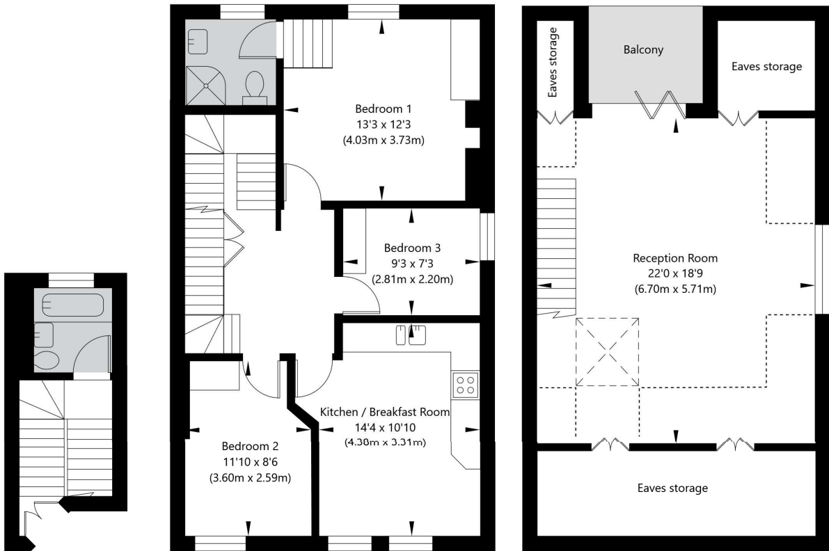
First Floor GROSS INTERNAL FLOOR AREA APPROX. 8.62 SQ M / 93 SQ FT