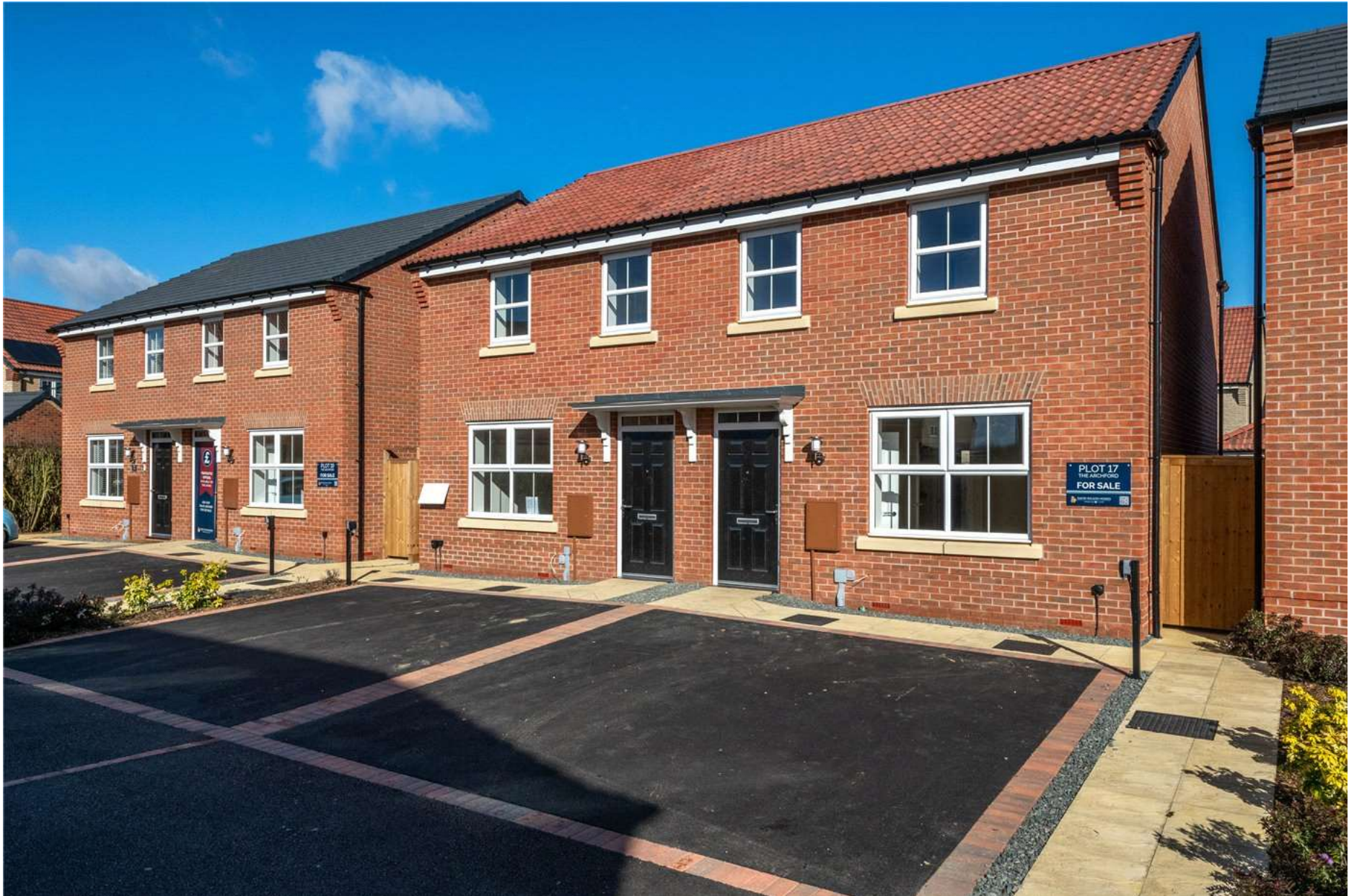
THE ARCHFORD BOURNE ROAD, CORBY GLEN £249,995 FREEHOLD