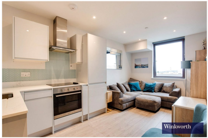
QUEEN'S HOUSE, KYMBERLEY ROAD, HA1 £270,000 LEASEHOLD