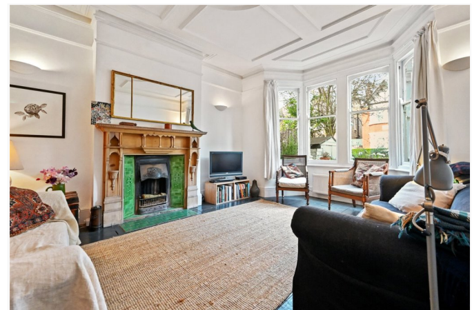
First Avenue, W3 £1,500,000 Freehold

A fabulous five/six bedroom Edwardian family house, with scope to further extend subject to the usual consents.