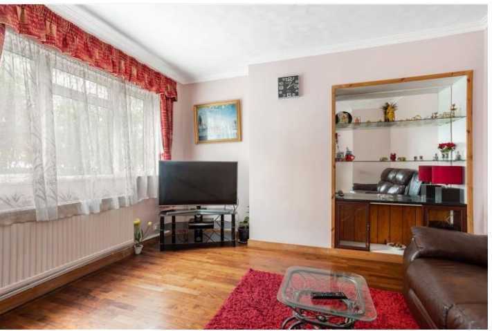
FRESHWATER ROAD, SW17 £575,000 FREEHOLD