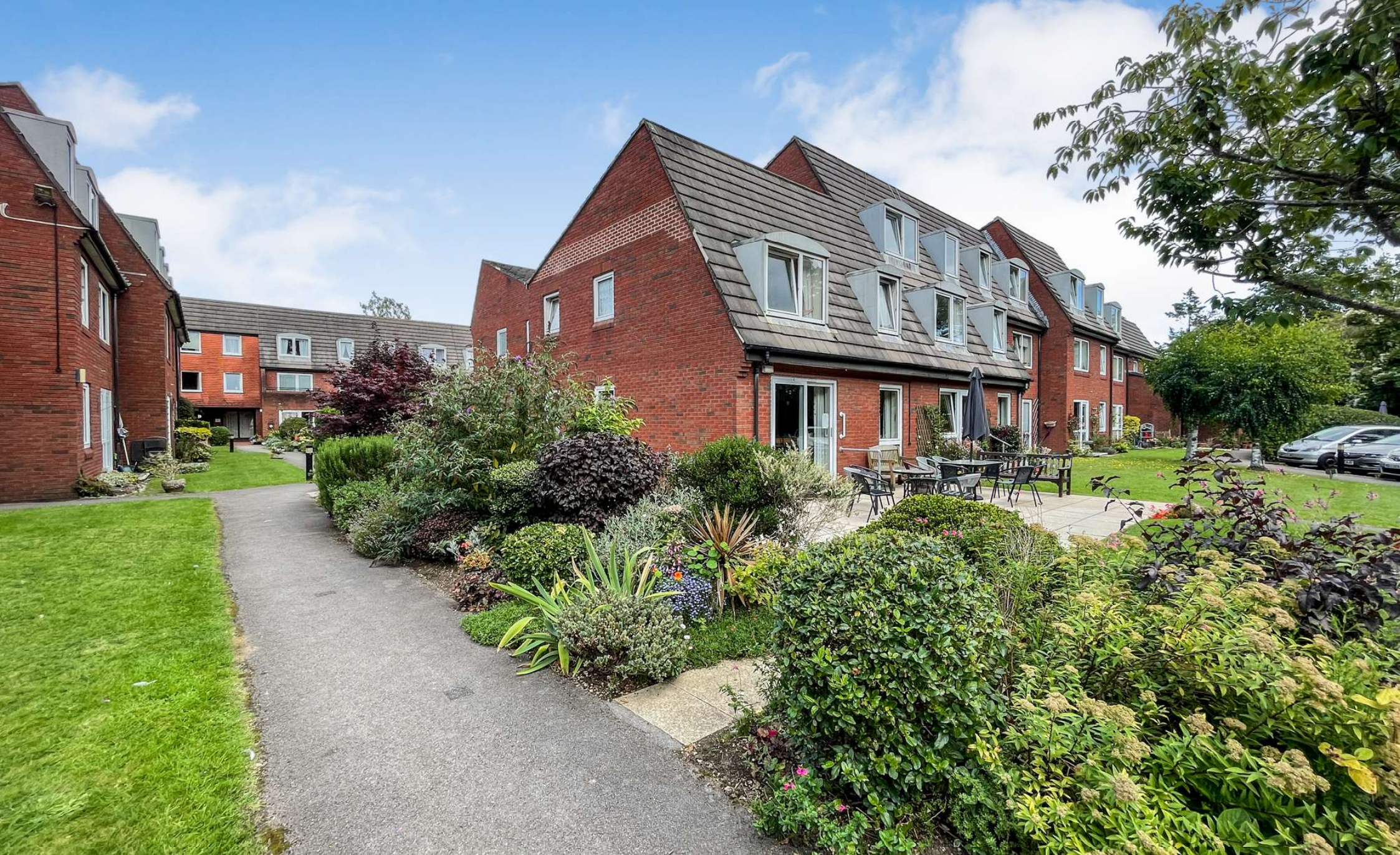
Homelands House, 535 Ringwood Road Ferndown, BH22 9DA Guide Price £90,000