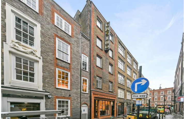
ARCHER STREET, LONDON, W1D £1,750,000 LEASEHOLD

A 2-BEDROOM 2-BATHROOM SPACIOUS NEW YORK TYPE OF LOFT CONVERSION IN GOOD CONDITION THROUGHOUT, SET IN A VICTORIAN HOUSE WITH AN OUTSIDE TERRACE RIGHT IN THE HEART OF BUSTLING SOHO, JUST OF RUPERT STREET. THE PROPERTY IS ON THE SECOND FLOOR (WALK UP).