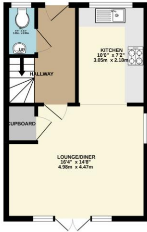
GROUND FLOOR 328 sq.ft. (30.5 sq.m.) approx.