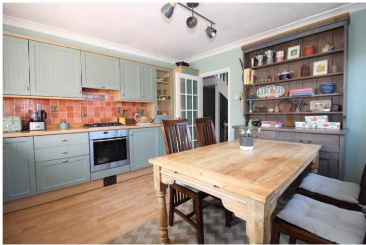
WINSTRE ROAD, HERTFORDSHIRE, WD6 £565,000 FREEHOLD