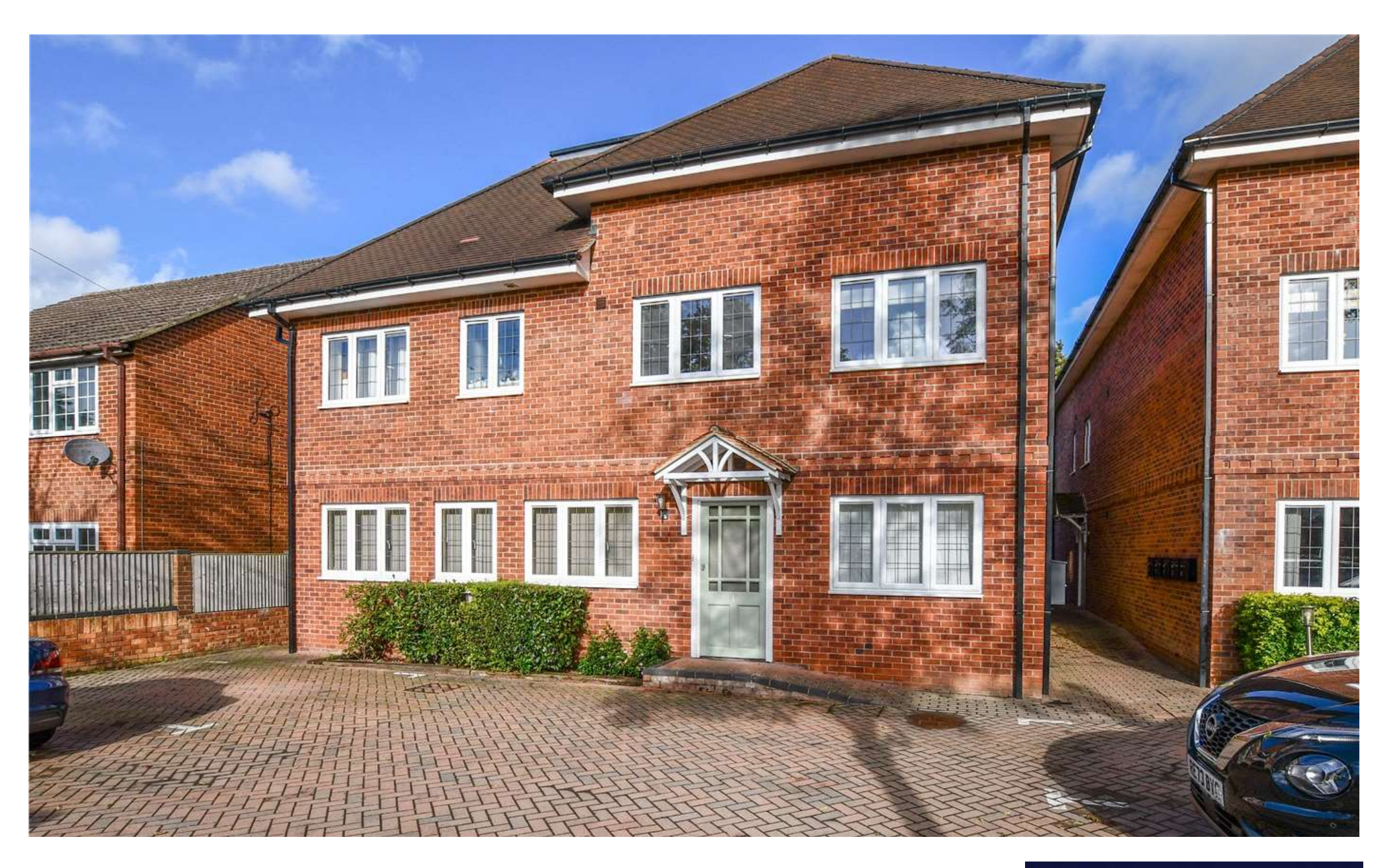
FLAT 1, 449 READING ROAD, WINNERSH, WOKINGHAM, BERKSHIRE, RG41 5HX £205,000 LEASEHOLD