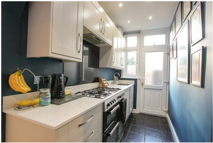
MARGUERITE DRIVE, LEIGH ON SEA £375,000 SHARE OF FREEHOLD