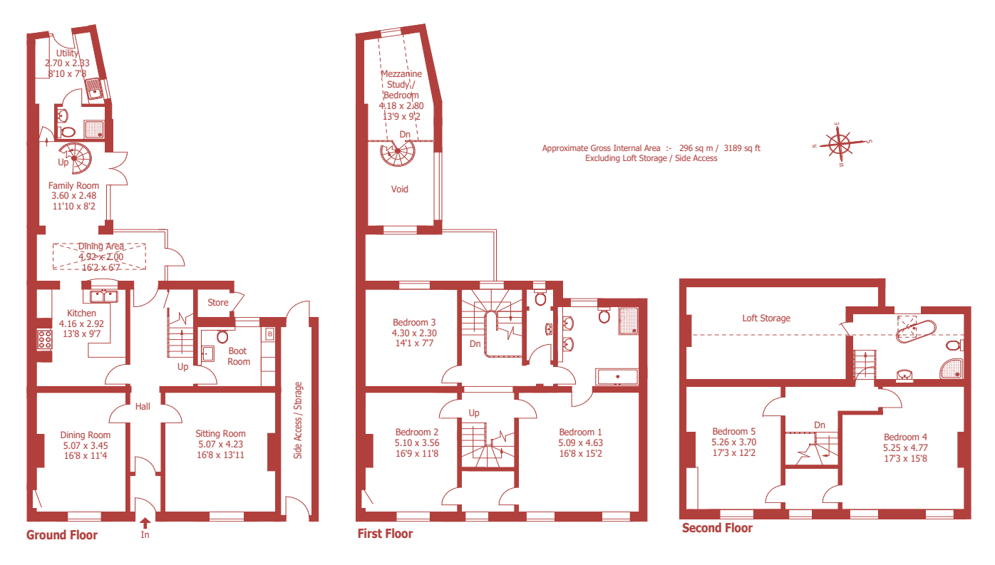
For identification purposes only, not to scale, do not scale Created using existing drawings and dimensions