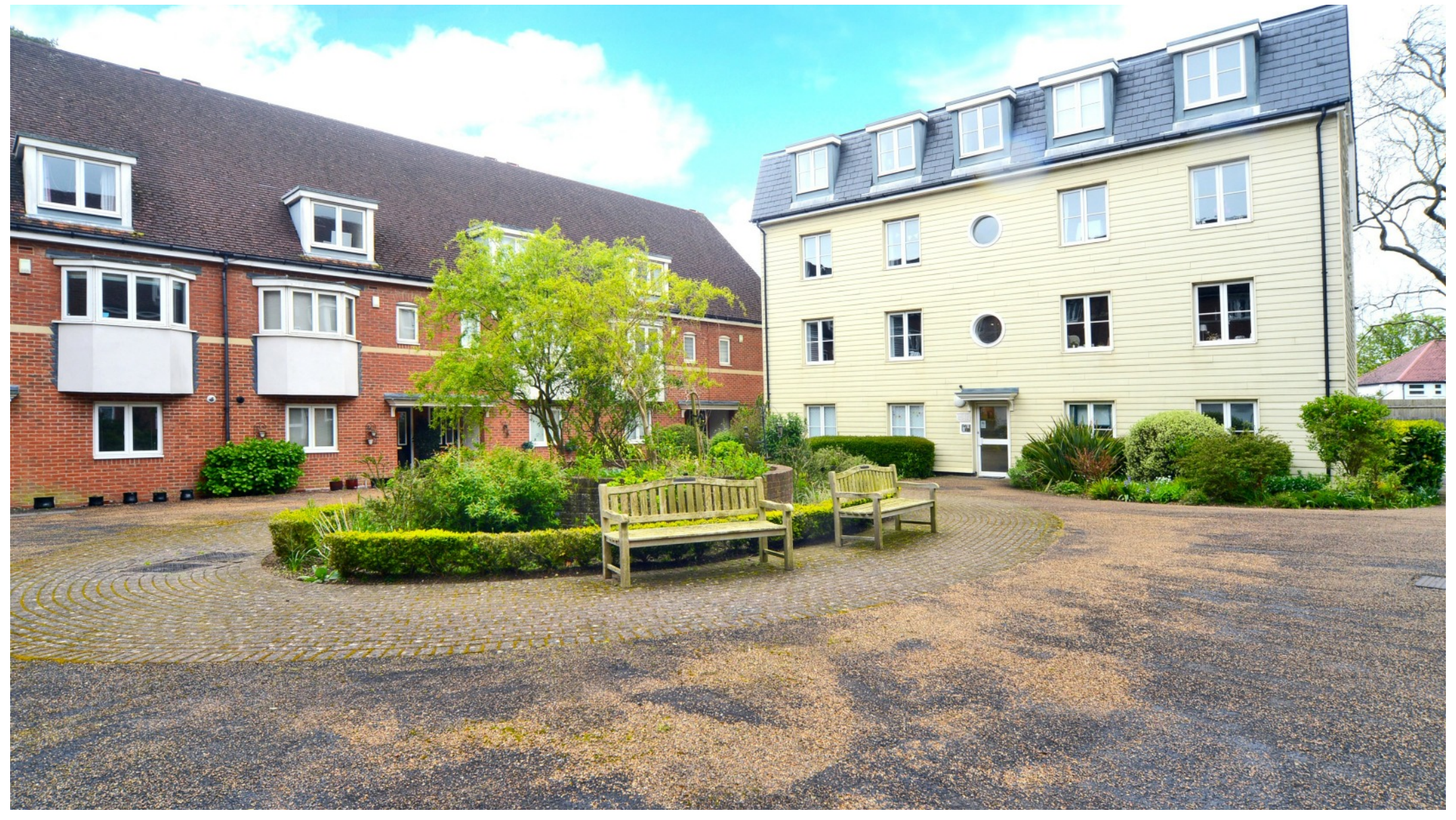
Under the Consumer Protection Regulations 2008, these Particulars are a guide and act as information only. All details are given in good faith and are believed to be correct at time of printing. Winkworth give no representation as to their accuracy and potential purchasers or tenants must satisfy themselves by inspection or otherwise as to their correctness. No employee of Winkworth has authority to make or give any representation or warranty in relation to this property.