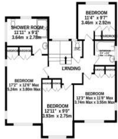
1ST FLOOR 864 sq.ft. (80.3 sq.m.) approx.