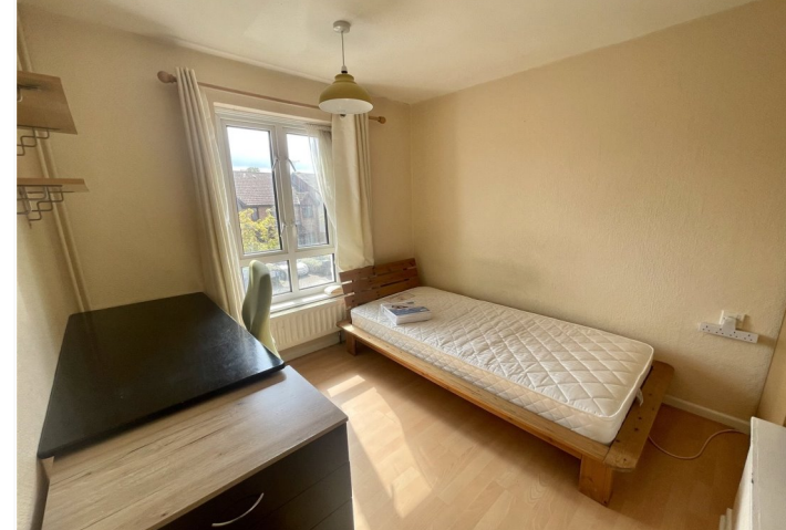
The Chantrys, Surrey, GU9