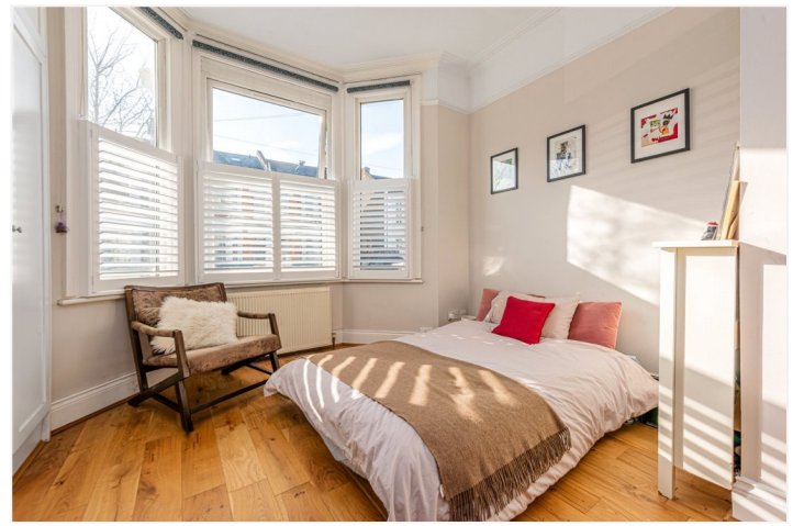
LEIGHTON GARDENS, KENSAL RISE, LONDON, NW10 £2,250 PER MONTH FURNISHED