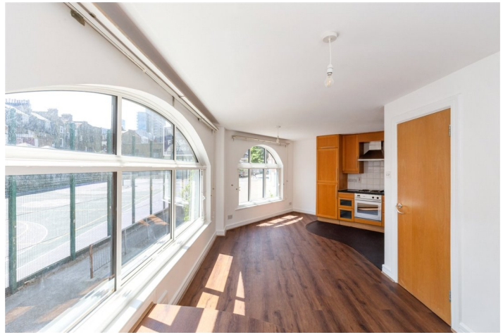
SHACKLEWELL STREET, LONDON, E2 £590,000 LEASEHOLD