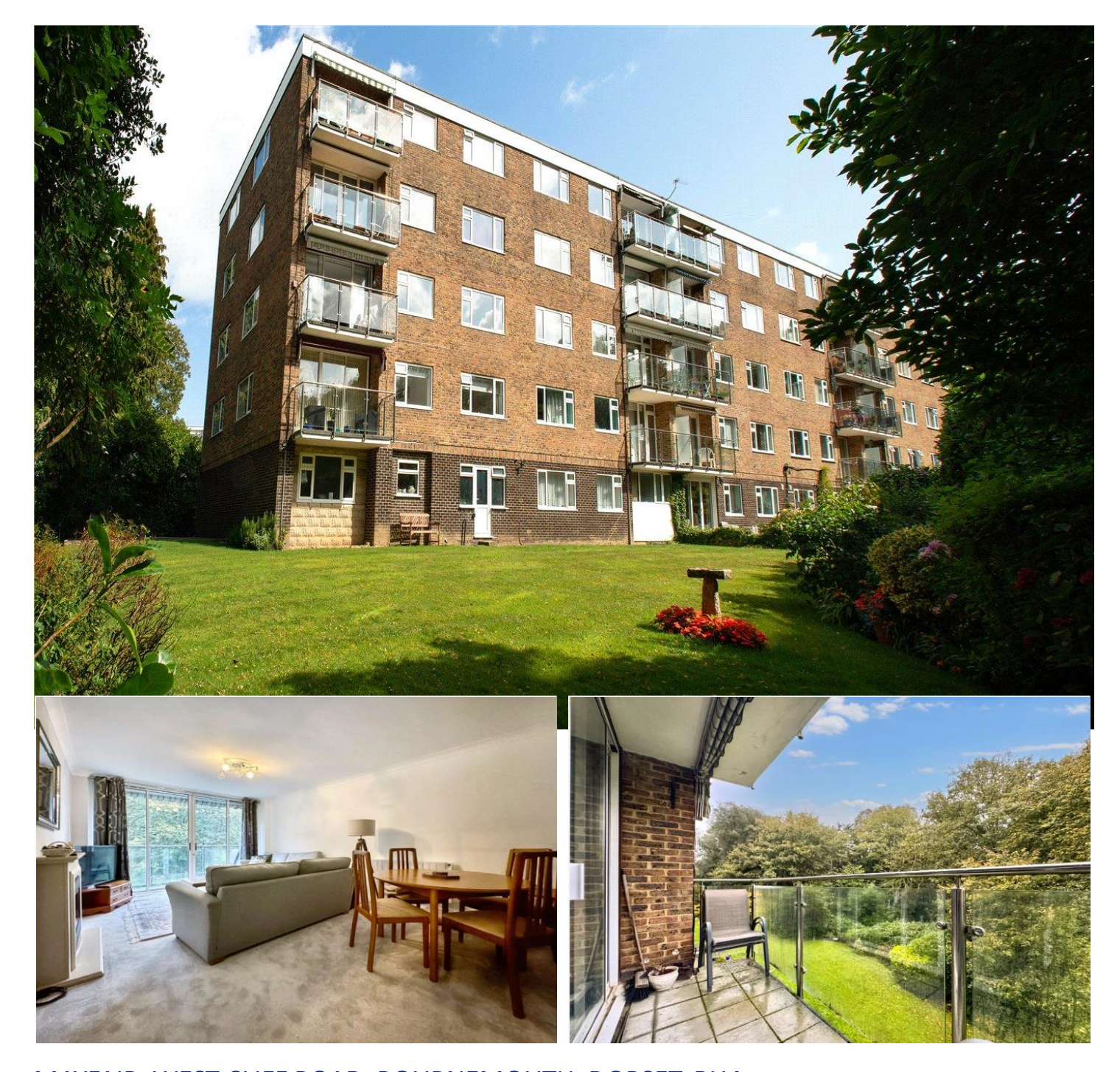
MAYFAIR, WEST CLIFF ROAD, BOURNEMOUTH, DORSET, BH4