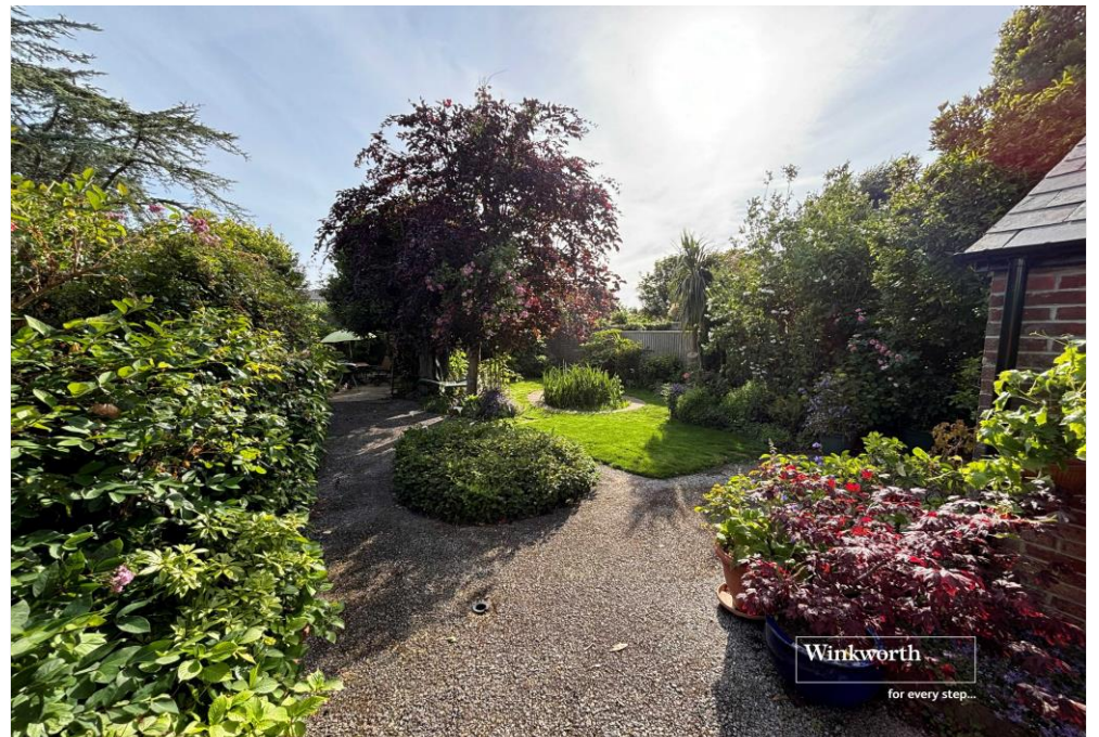
Winkworth for every step...