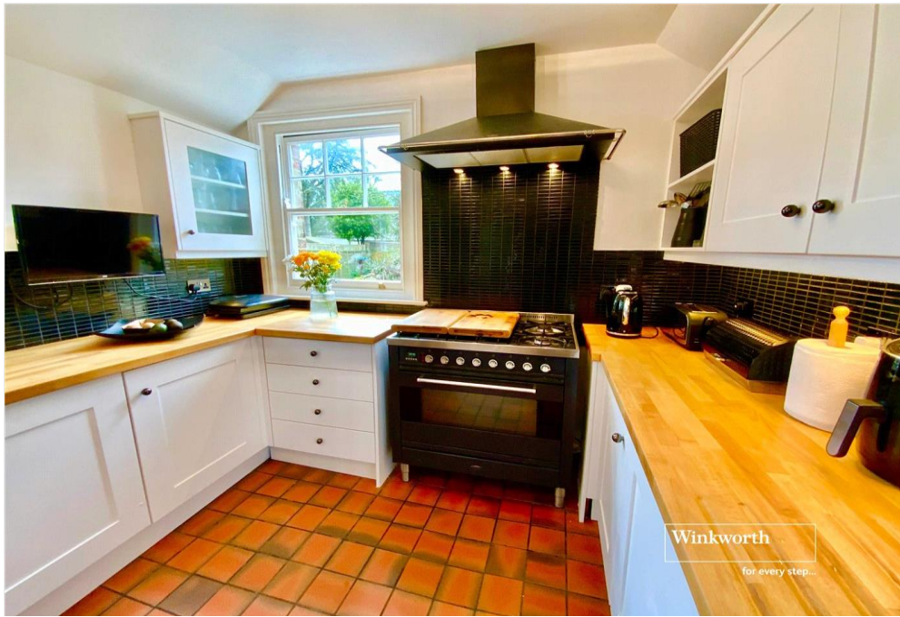
Winkworth for every step...