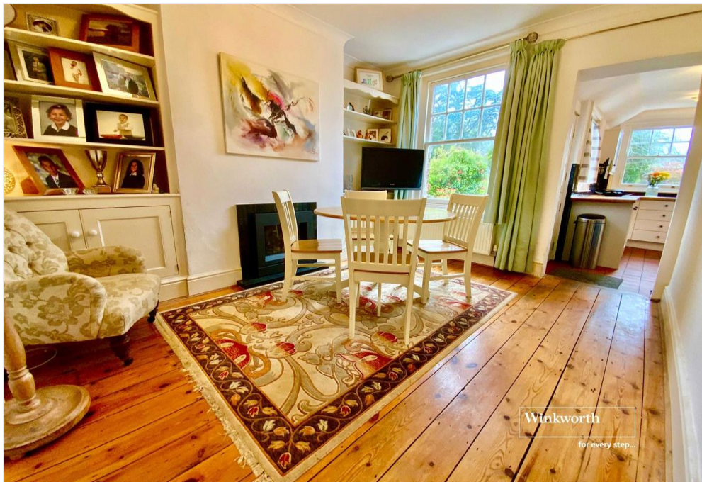
Winkworth for every step...