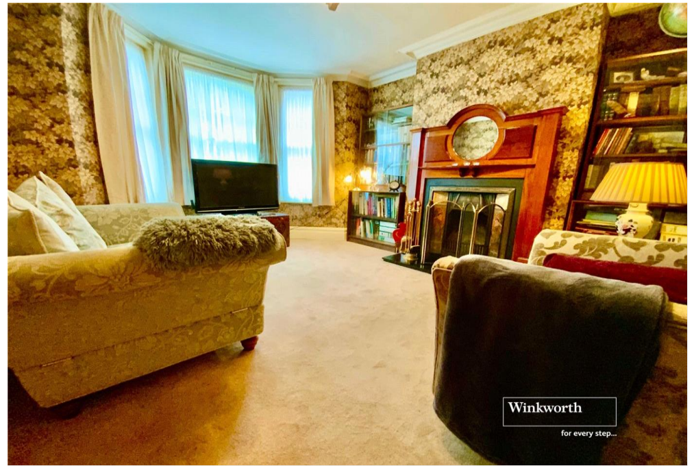
Winkworth for every step...