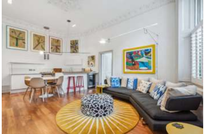
CLEVELAND SQUARE, BAYSWATER, W2 £1,375,000 LEASEHOLD

LOCATED IN W2 - CLEVELAND SQUARE, SET IN A HANDSOME GRADE II STUCCO FRONTED VICTORIAN FORMER TERRACE HOUSE, ACCESSED THROUGH A PROJECTING DORIC PORCH, A STUNNING TWO BEDROOM, LATERAL RAISED GROUND FLOOR APARTMENT, WITH IMPRESSIVE HIGH CEILINGS, INTRICATE CORNICING, AND ACCESS TO THE EXCLUSIVE PRIVATE SQUARE GARDENS.