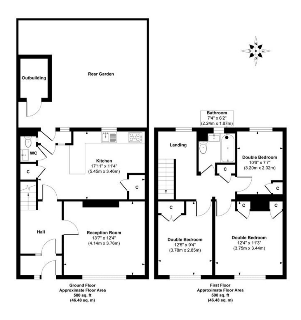
Approx. Gross Internal Floor Area 1000 sq. ft / 92.96 sq. m (Excluding Outbuilding)

Illustration for identification purposes only, measurements are approximate, not to scale. Produced by Elements Property