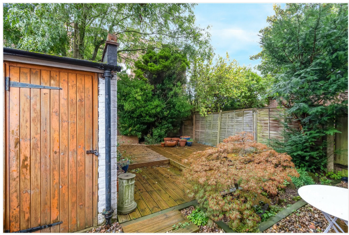
MELFORD ROAD, EAST DULWICH, LONDON, SE22 OIEO £600,000 LEASEHOLD