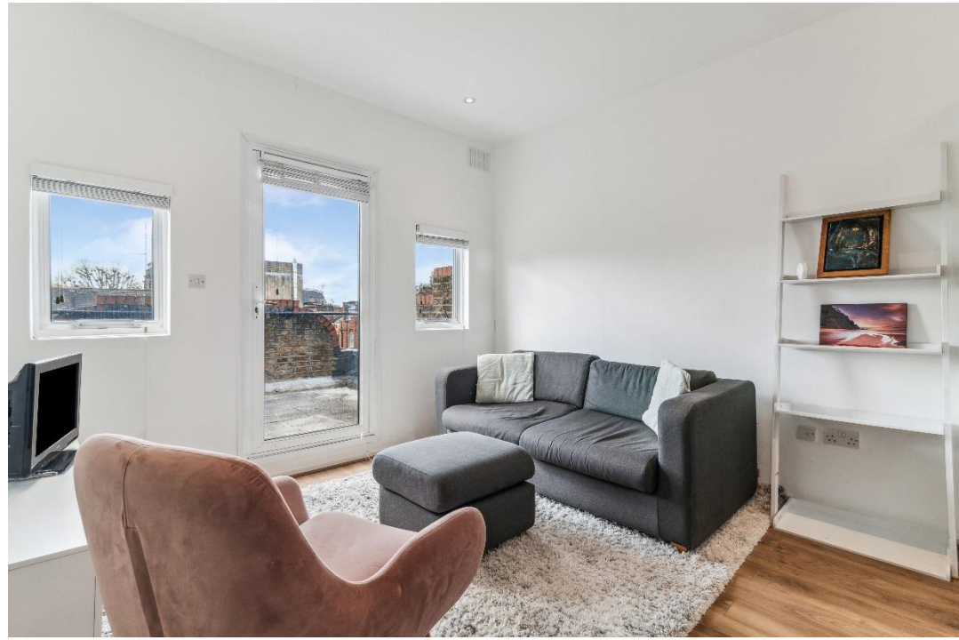
Private Roof Terrace | Share of Freehold | Communal Gardens