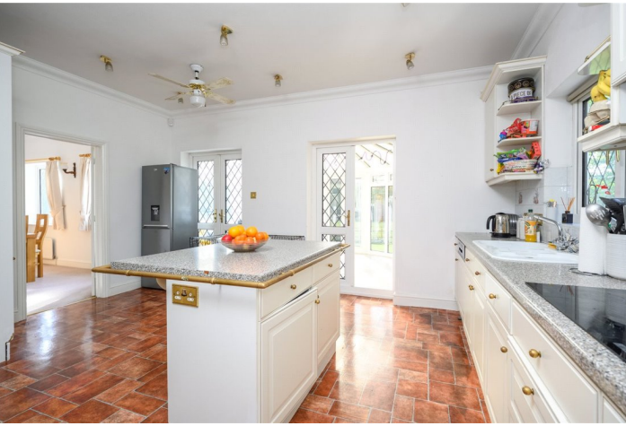
BYFLEET ROAD, COBHAM, SURREY, KT11 £4,250 PER MONTH UNFURNISHED