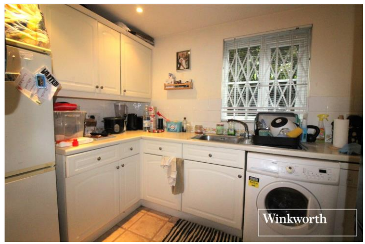
CROFT COURT, BOREHAMWOOD, HERTFORDSHIRE, WD6 £1,500 PER MONTH UNFURNISHED