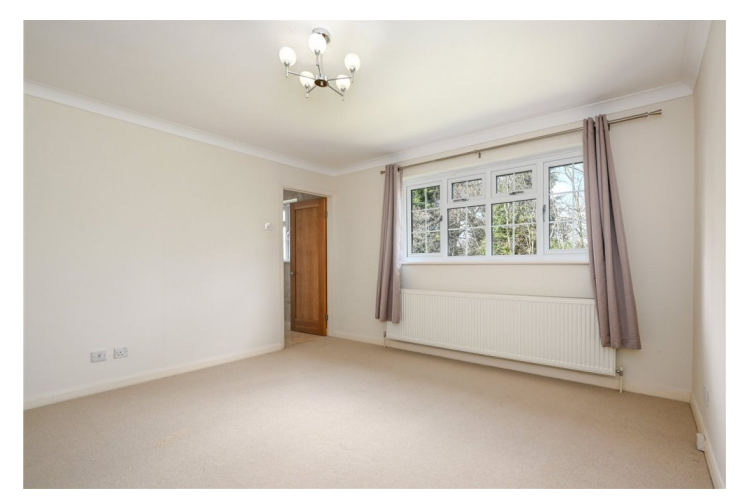
Council Tax Band: G

A spacious 4 bedroom detached family house with a lovely mature rear garden, double garage and additional off-street parking. This property is set back from the road in a cul de sac off of Steels Lane and is conveniently located close to Oxshott village as well as the mainline train station.