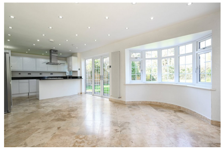
ULLSWATER, STEELS LANE, OXSHOTT, LEATHERHEAD, SURREY, KT22 £4,500 PER MONTH