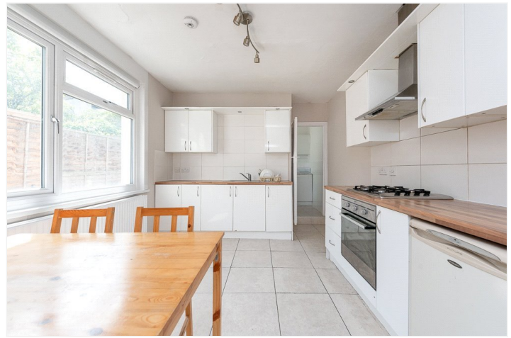
CORNWALL GARDENS, WILLESDEN GREEN, LONDON, NW10 £3,250 PER MONTH UNFURNISHED