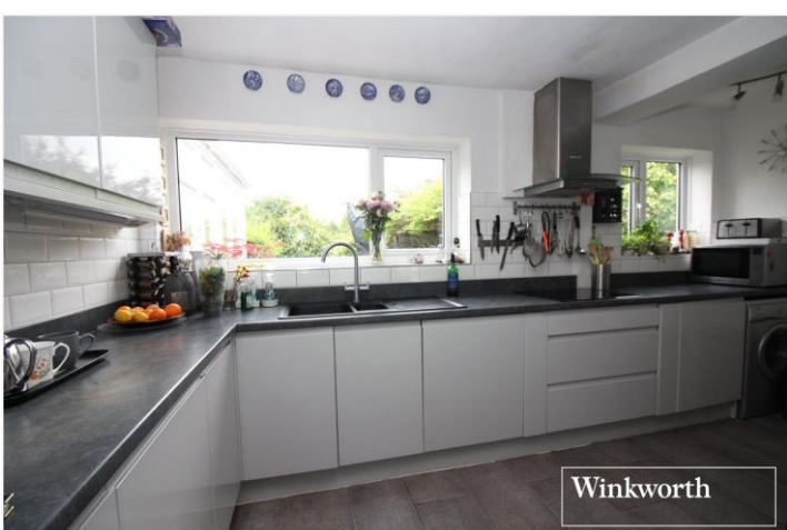
CARRINGTON AVENUE, HERTSMERE, WD6 £975,000 FREEHOLD