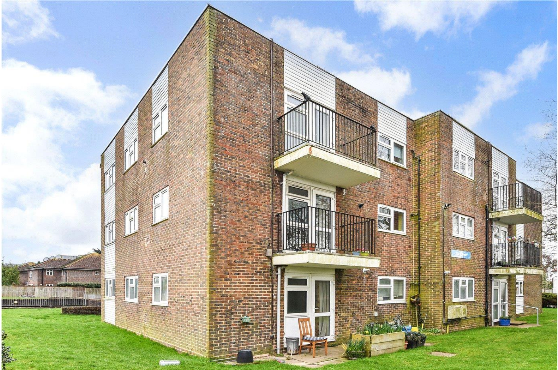
MERLIN COURT, WORTHING £220,000 LEASEHOLD