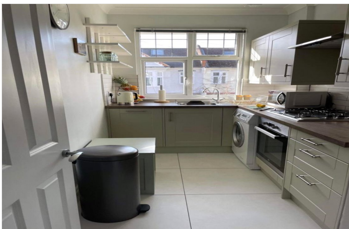
CLIVE ROAD, SW19 £2,350 PER MONTH FURNISHED