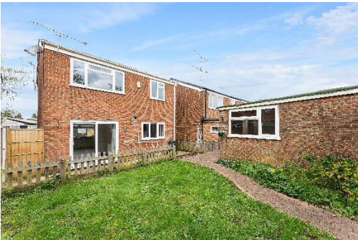
Outbuilding Approx. 12.3 sq. metres (132.5 sq. feet)