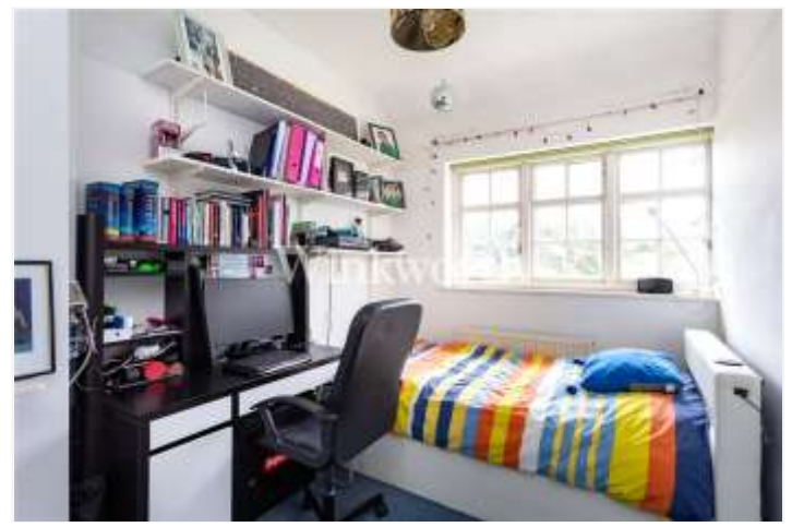
OAKWOOD ROAD, NW11 £735,000 FREEHOLD