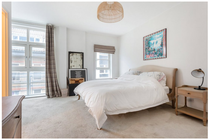
CITY PAVILION, CHILTON STREET, LONDON, E2 £1,100,000 SHARE OF FREEHOLD