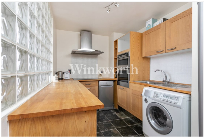
CORRIB COURT, LONDON, N13 OFFERS OVER £300,000 LEASEHOLD

A LOVELY ONE-BEDROOM GROUND FLOOR FLAT IN A CHARACTER GRADE II LISTED SCHOOL CONVERSION IN A CONSERVATION AREA.